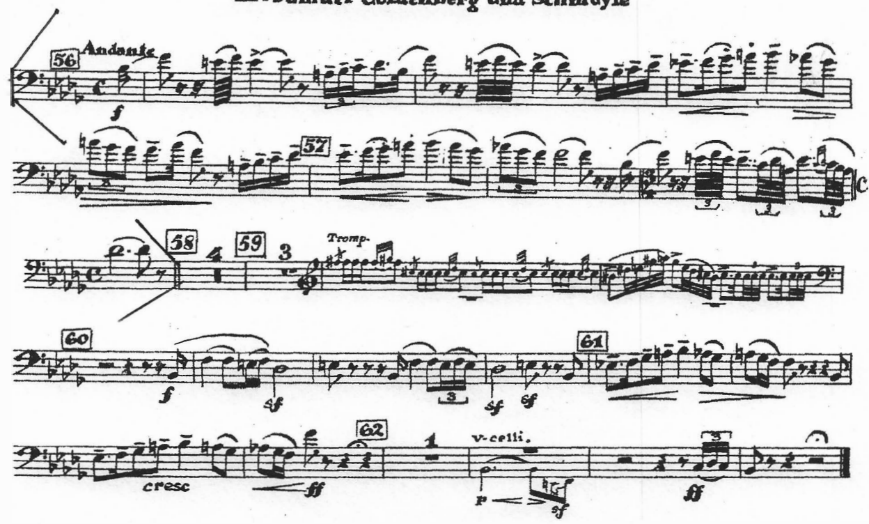
VII. Limoges - Le Marché