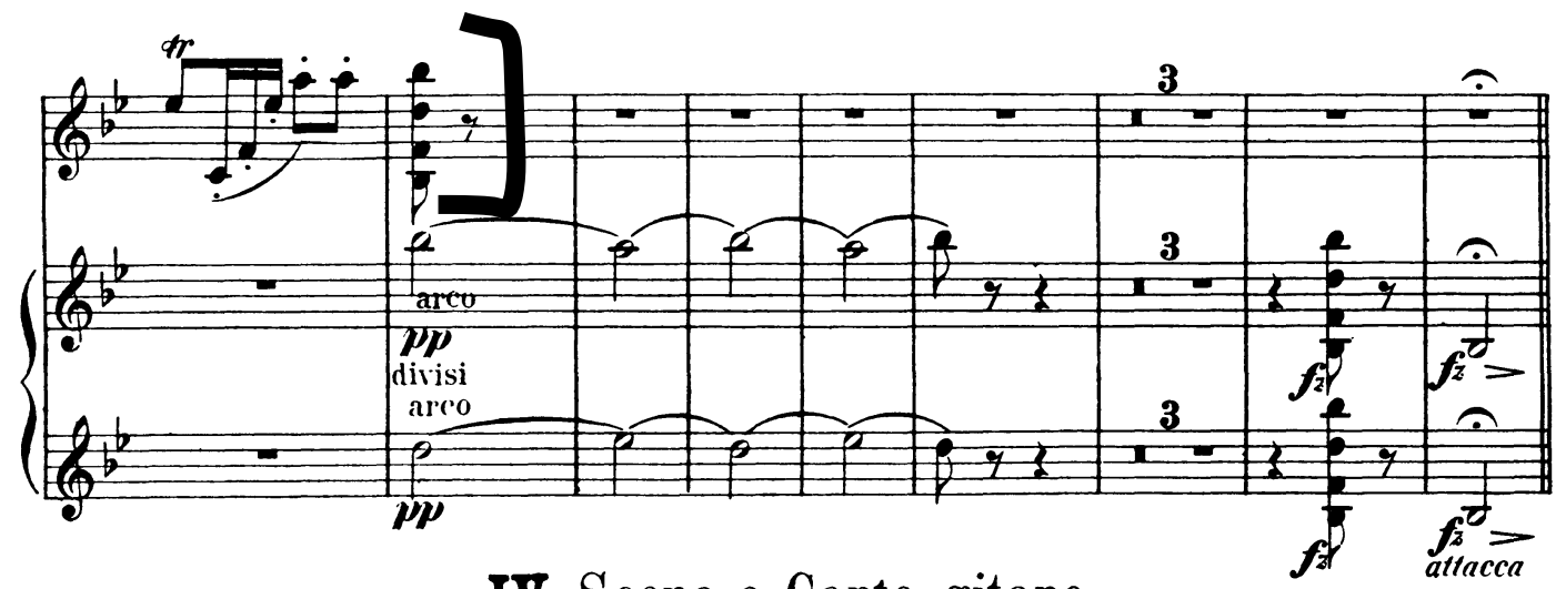
IV. Scena e Canto gitano