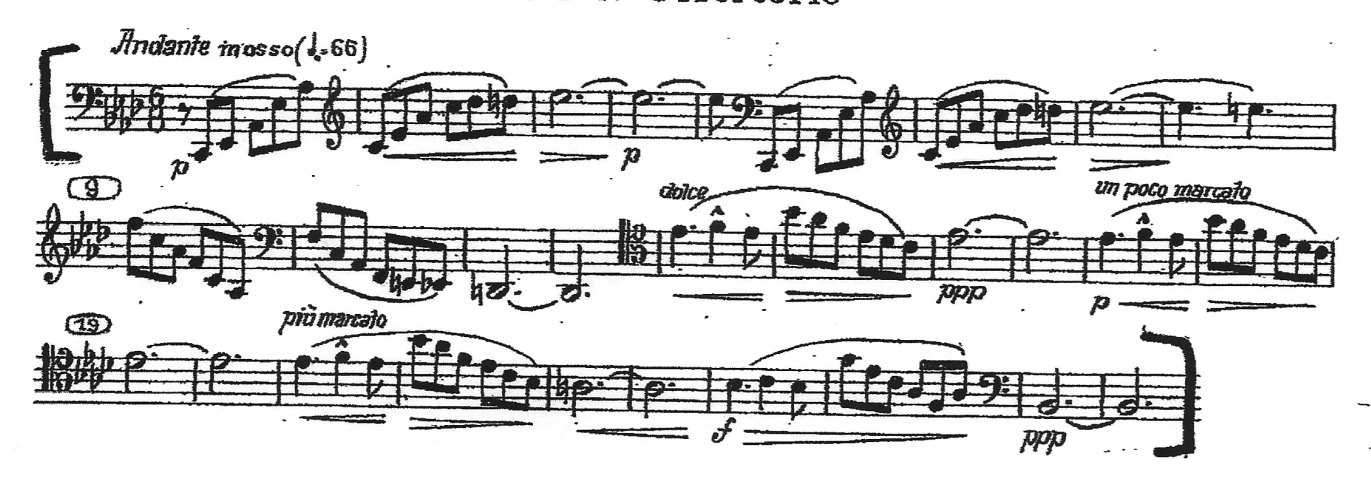
Nr. 3. Offertorio